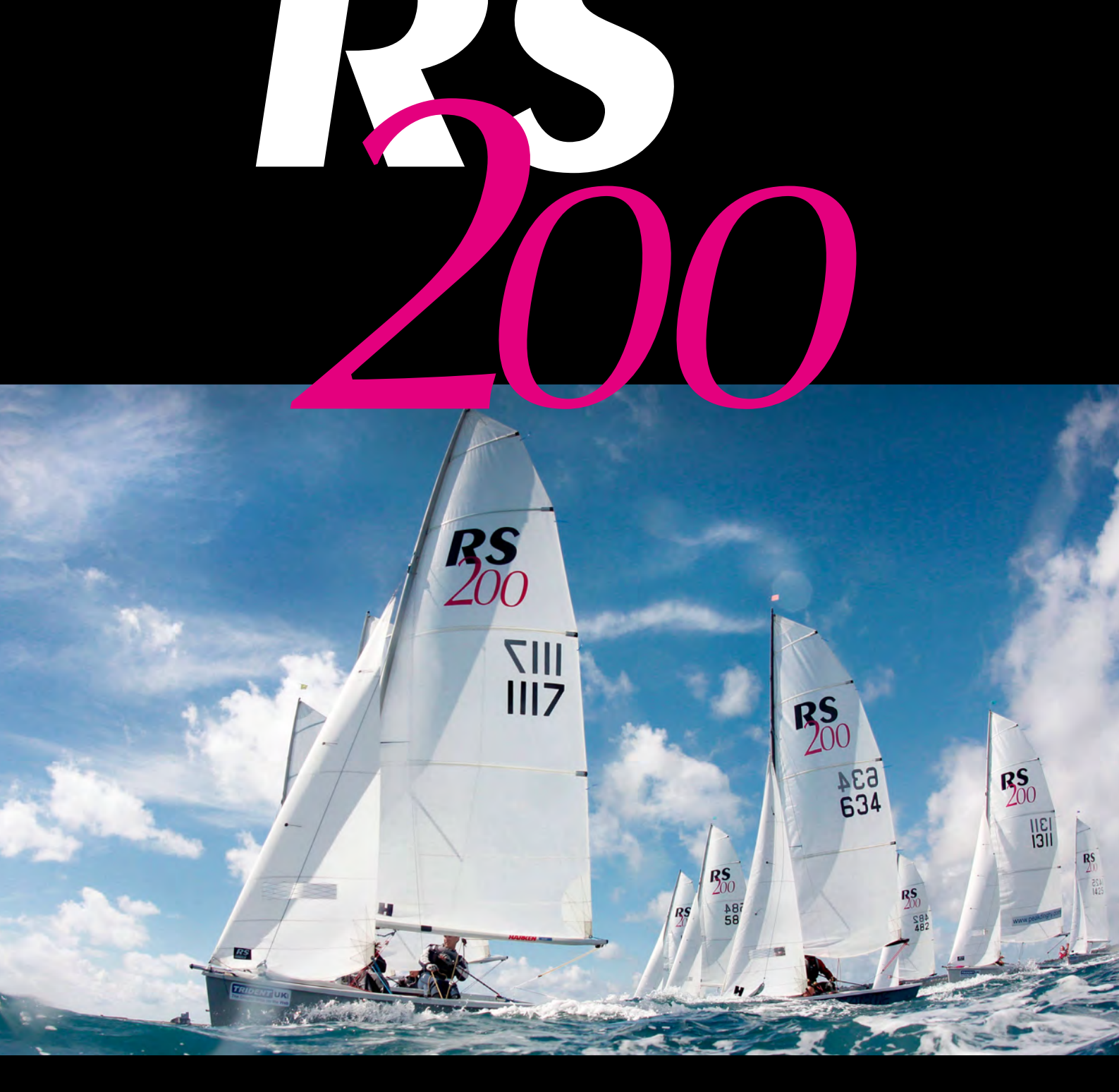
Sail it. Live it. Love it.