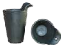
72012001 SCUPPER PLUG (QUEST / KONA / OUTBACK)