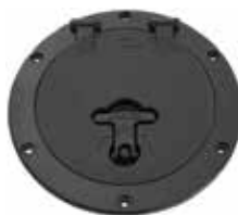
71701011 HATCH 6" TWIST AND SEAL 71701001 HATCH 6" TWIST AND SEAL RETRO KIT 71321001 FLANGE GASKET 71701021 LID O-RING 8031131 SCREW