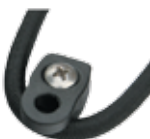
78510001 BUNGEE HOOK 8031961 SCREW