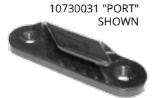
10730031 "PORT" SHOWN