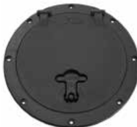
71702011 HATCH 8" TWIST AND SEAL 71702001 HATCH 8" TWIST AND SEAL RETRO KIT 71331001 FLANGE GASKET 71702021 LID O-RING 8031131 SCREW