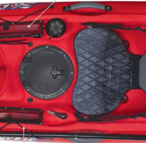
8031570 SCREW / PADDLE KEEPER BUNGEE 79538201 WEB PULL TAB