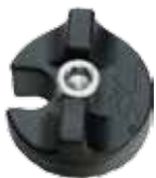
2008 AND OLDER 81410001 CAM LOCK KNOB BOLTS VARY BY MODEL