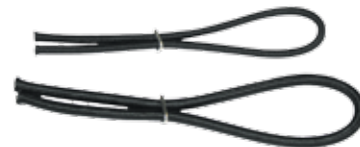
RS018BLK 1/8" SHOCKCORD RS316BLK 3/16" SHOCKCORD RS014BLK 1/4" SHOCKCORD 79538201 WEB PULL TAB