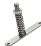
81372001 CRANK OLDER AI-OUTFIT H071 SPRING 8080691 NYLON WASHER