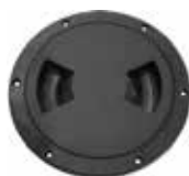
71130001 HATCH 5" SCREW-IN 8031501 SCREW